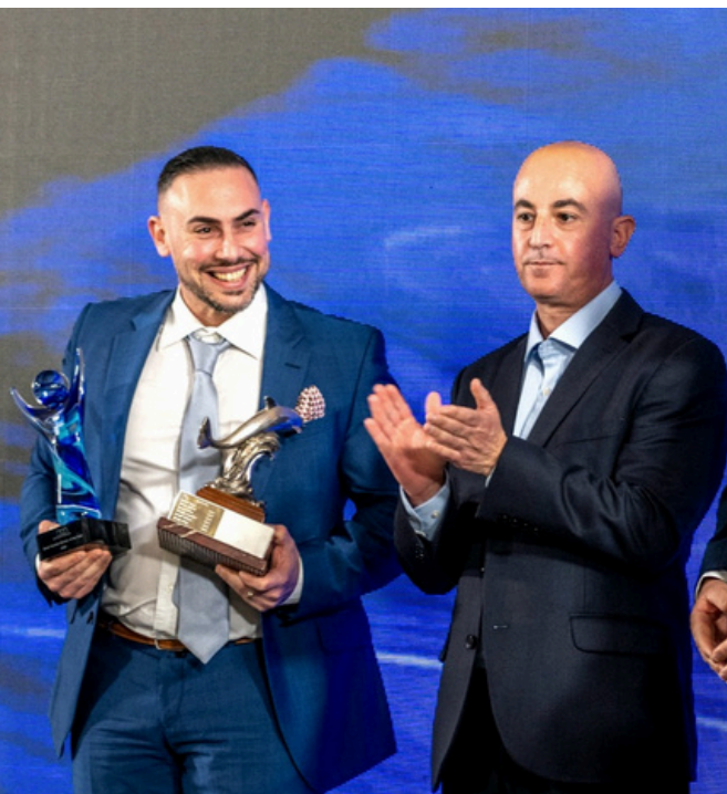
Tourism Worker of the Year Award