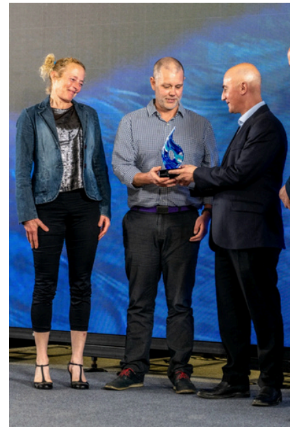
Gozo Cultural Niche Award