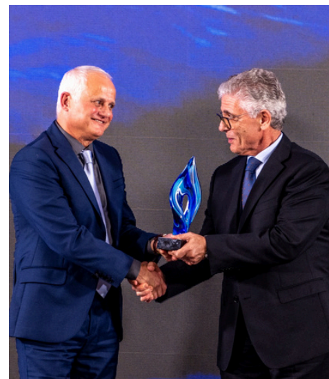
Special Recognition Award