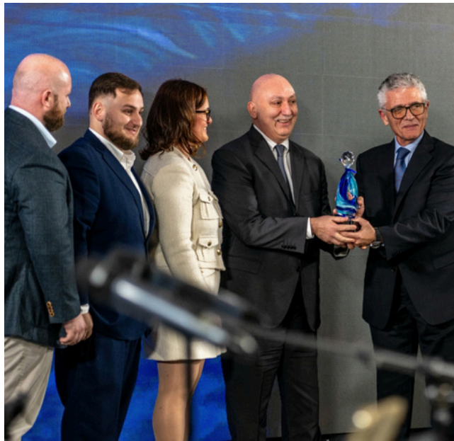
Lifetime Achievement Award