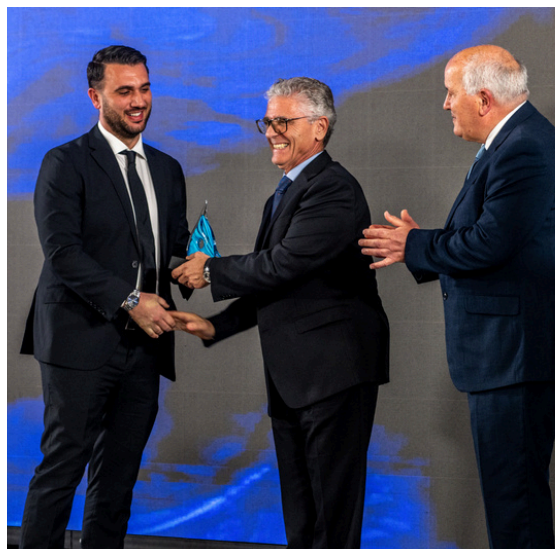
Gozo Tourism Commitment Award