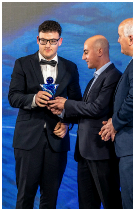
Young Worker of the Year Award