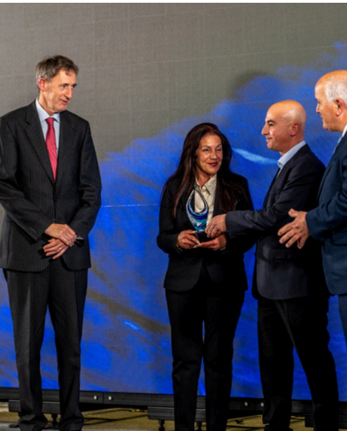
Gozo Business Niche Award