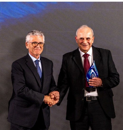
Special Recognition Award